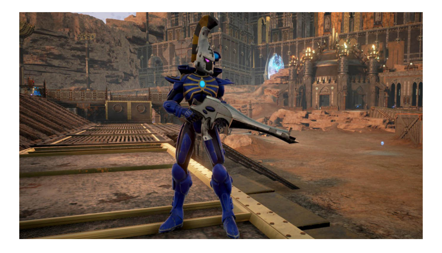
Download ->>->> http://bit.lv/2SK0g7i

Warhammer 40,000: Eternal Crusade - Mael Dannan Weapon Pack Crack Activation Code Download